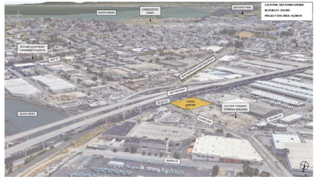
DEPARTMENT OF HOMELESSNESS AND SUPPORTIVE HOUSING EVANS SHELTER REPLACEMENT CONCEPT DESIGN - 08/07 | 7.11.2019